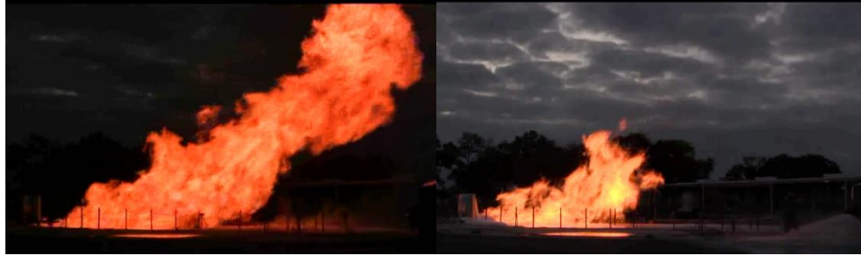
Figure 2 LNG pool fire control using high expansion foam (left: fire without foam, right: fire with foam)

and pool fire hazards. The findings can be used to guide high expansion foam application in industry and develop a CFD model of LNG and foam system for risk analysis.